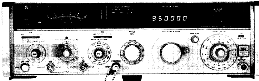
HP 8640B (with Option 001, 002, 003)